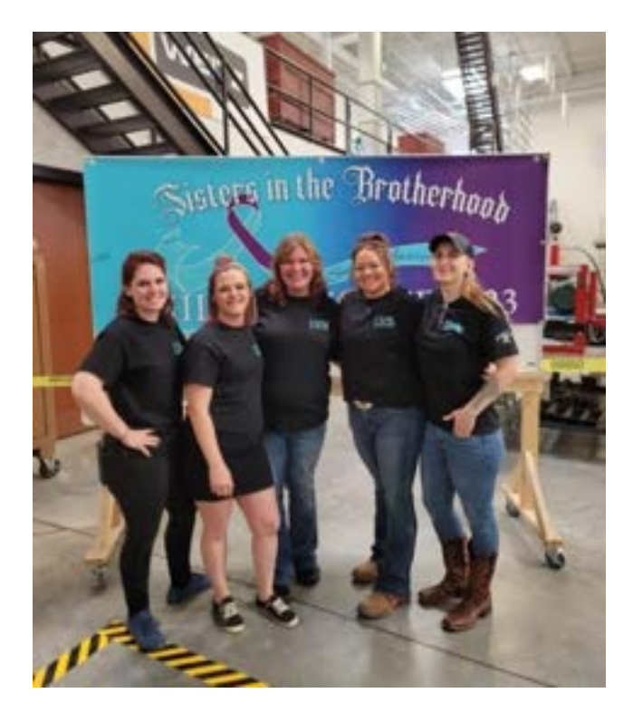
North Central States SIB Committee members at the mental health & suicide awareness fundraiser in Nebraska.

In Minneapolis/St. Paul , the SIB Committee worked with Women Building Success to set a Women In Construction photo display at the State Capitol Building. The display was then placed in the Rochester city hall.